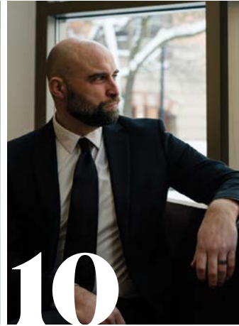
The Professor Who Officiated a Wedding and Lost Everything