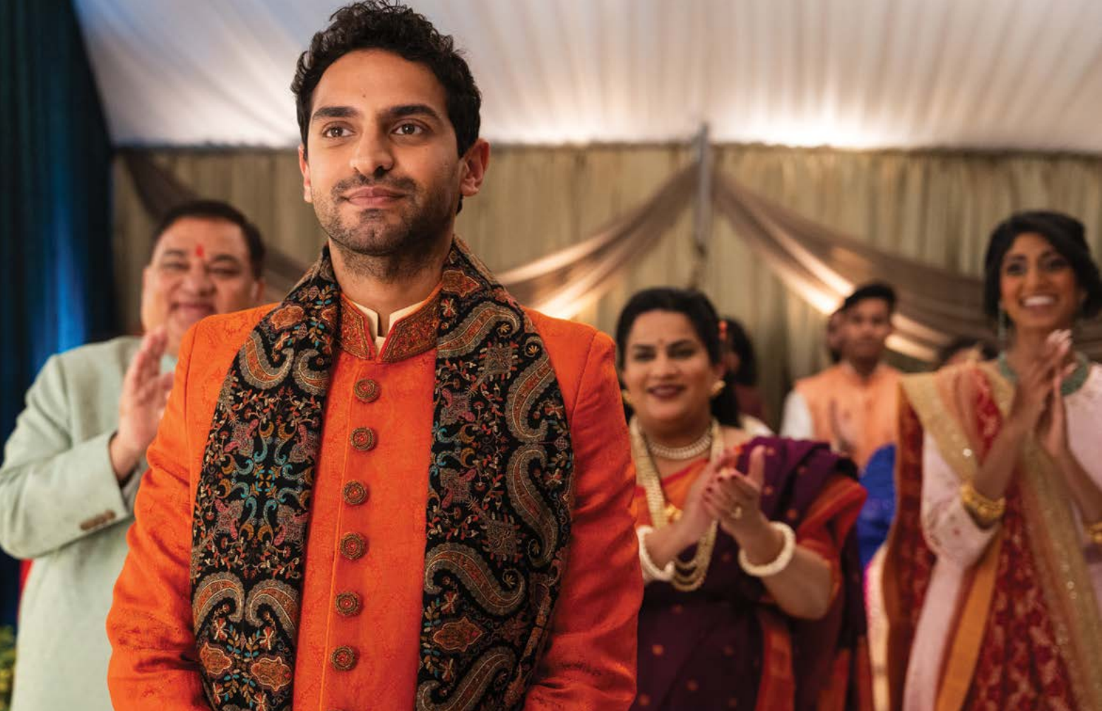
Karan Soni as Naveen in "A Nice Indian Boy."