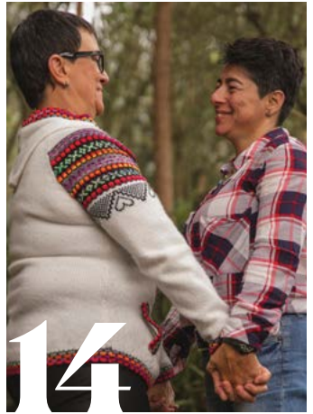
Forget the Pink Sashes: The Butchlorette Party Has Arrived