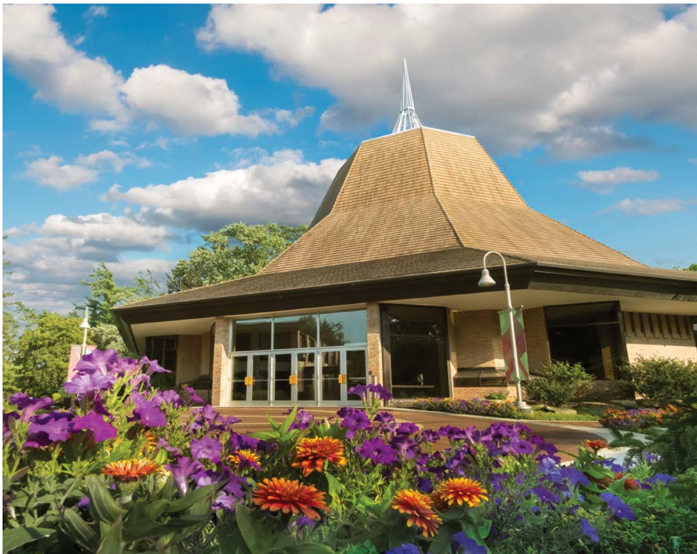
Calvin University Chapel.