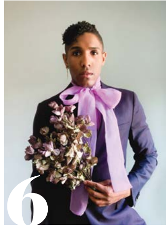
Flower Power: Why Modesty Is Never the Answer