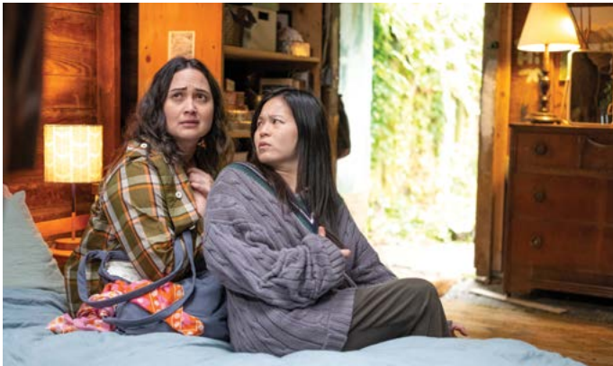
(Left) Lily Gladstone and Kelly Marie Tran in “The Wedding Banquet.”